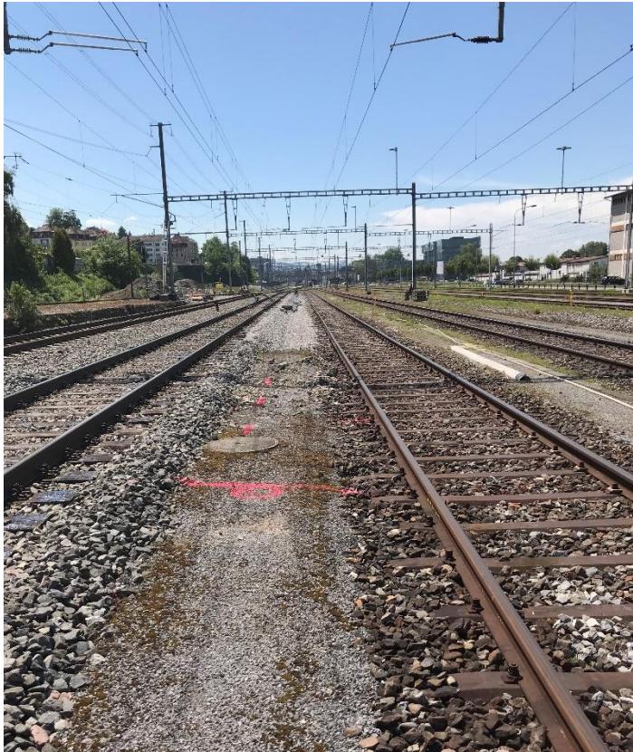
View of the section to be bonded for the central drainage