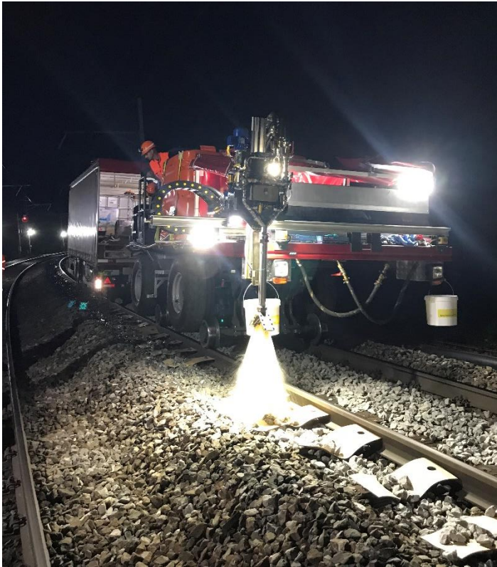
View of the bonding ballast system with trailer