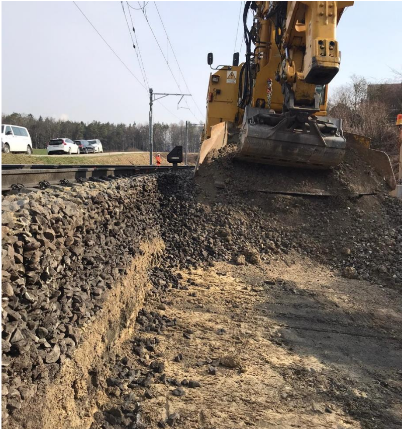
View on the uncovered ballast bonding