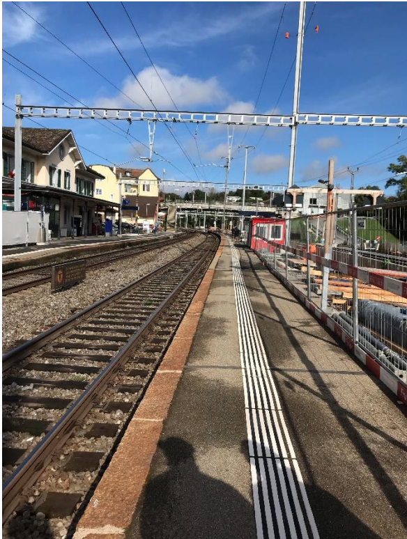
View of the platform