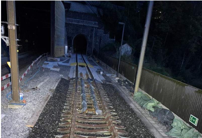
View on the ballast bonding